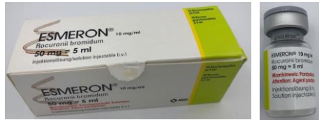
Esmeron fiol rocuronium 50 mg = 5 mL (10 mg/mL) (1 x 10) article 409628