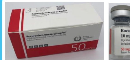
Rocuronium fiol rocuronium 50 mg = 5 mL (10 mg/mL) (1 x 10) Article 480928