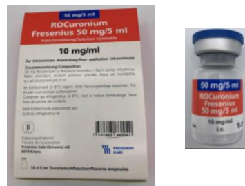
Rocuronium fiol rocuronium 50 mg = 5 mL (10 mg/mL) (1 x 10) article 453888

En raison du contexte COVID-19, ces différents médicaments peuvent être en circulation simultanément. Tous sont à stocker au frigo.