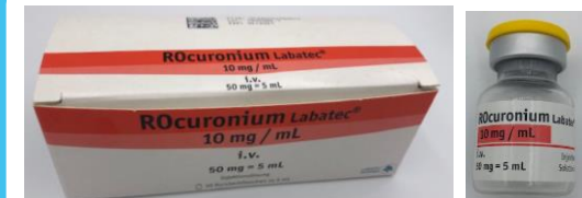
Rocuronium fiol rocuronium 50 mg = 5 mL (10 mg/mL) (1 x 10) article 480869