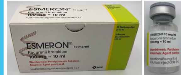
Esmeron fiol rocuronium 100 mg = 10 mL (10 mg/mL) (1 x 10) article 84921

En raison du contexte COVID-19, ces différents médicaments peuvent être en circulation simultanément. Tous sont à stocker au frigo.